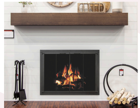
Shown in White