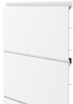
Built-in simple mounting system