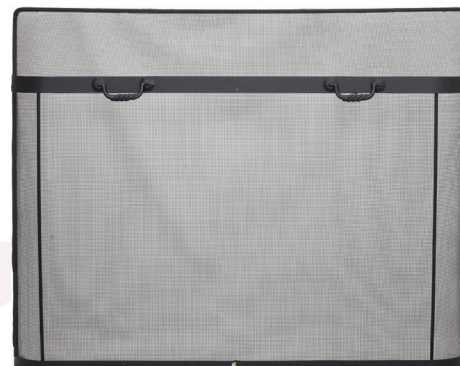
Pressure Screw Mounting